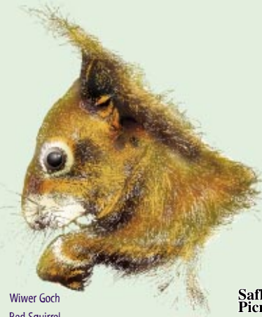
Wiwer Goch Red Squirrel BRECHFA

14 Look out for the uncommon Red Squirrel and many birds including Goldcrests, Nuthatches, Blue Tits and Great Tits.