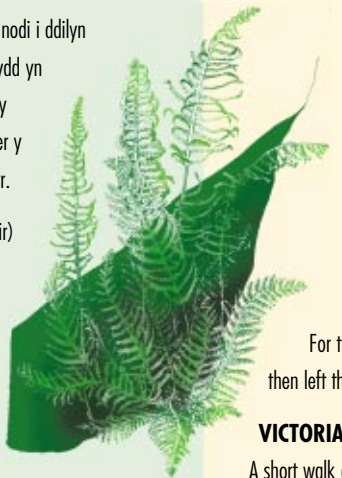
Rhedyn Bras Hard Fern